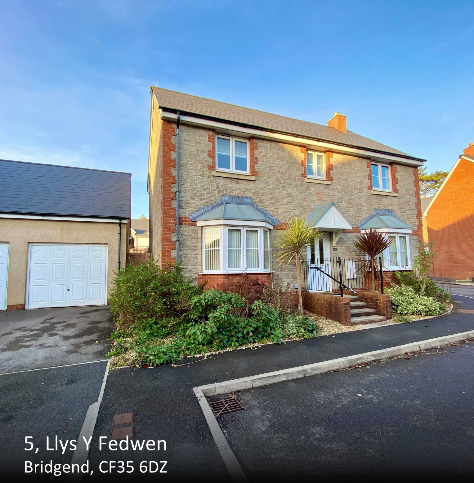
5, Llys Y Fedwen Bridgend, CF35 6DZ